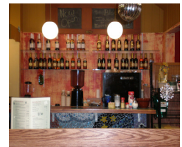
Our new mosaic coffee bar

exacting standards. Wow! What a mouth full, we just serve a great cup of coffee! Come in and see why.